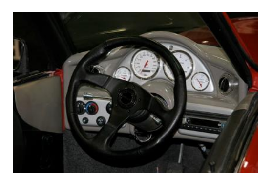
Economy ~ Ecology ~ Excitement ™