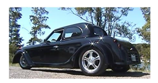
*Depending on battery options & driving conditions. Specifications are subject to change without notice.