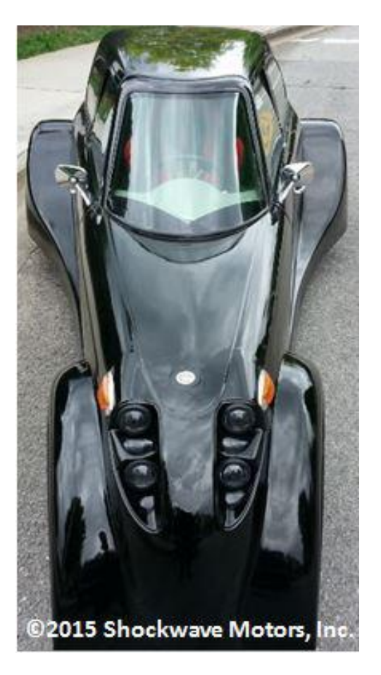
Home of the Defiant EV<sup>3</sup> Roadster

Get charged up and save the planet one mile at a time! TM